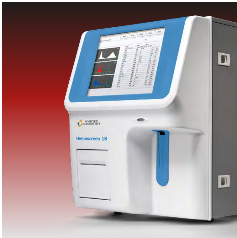
HEMASCREEN 18 AUTOMATIC CELL COUNTER